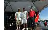
Walleye Weekend fishermen awarded