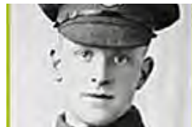
11 Jaw-Dropping Civil War Facts Ancestry.com