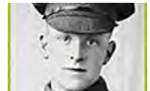
11 Jaw-Dropping Civil War Facts Ancestry.com