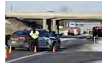
State 55 crash under U.S. 41 in Kaukauna