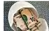
A Way to Pay Off Mortgage You Should... Bills.com