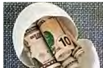
A Way to Pay Off Mortgage You Should... Bills.com