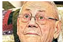
14 Benefits Most Seniors Didn't Know ... Newsmax