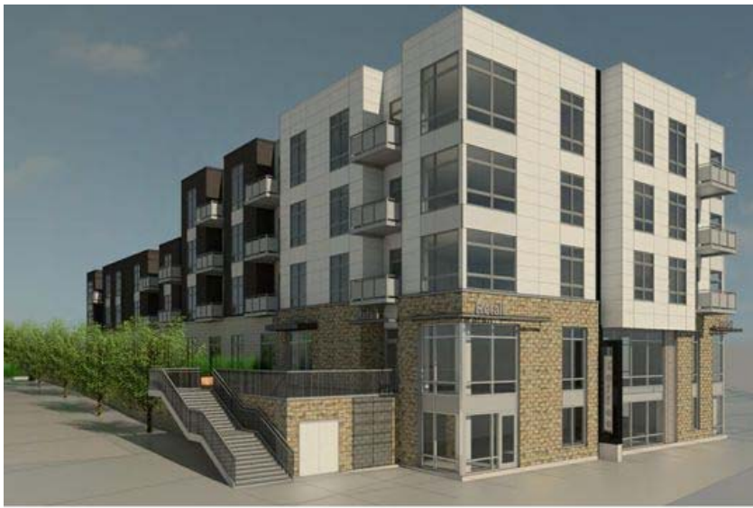
RiverHeath - B5

NW Perspective, Design View Scale: N.T.S.