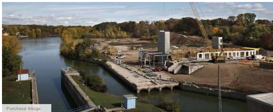
Workers from C.D. Smith Construction of Fond du Lac work on the newest riverfront development project under way along the Fox River and College Avenue bridge in Appleton. The 32-unit apartment building is called 'Evergreen.'