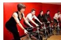
The #1 Exercise that Accelerates AGING ... Old School New Body