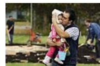
Neighbors come together for Appleton