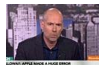
Did Apple Make a Huge Error on iPad ... Bloomberg