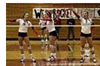
Neenah Rockets 3, Appleton East Patriots